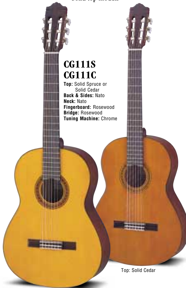
Top: Solid Cedar

Top: Solid Spruce Back & Sides: Nato Neck: Nato Fingerboard: Rosewood Bridge: Rosewood Tuning Machine: Chrome