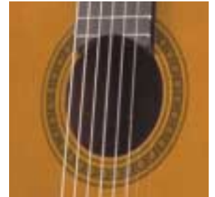
CG101/111S/111C Hole Design