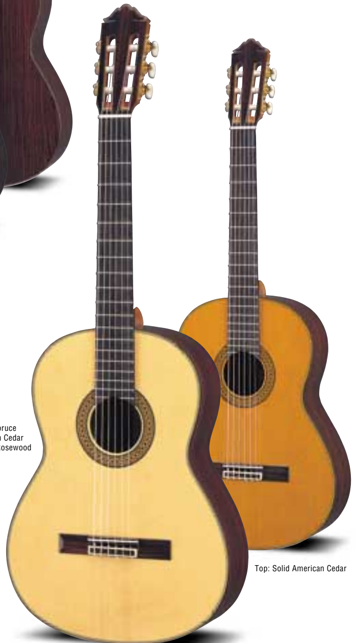
Top: Solid European Spruce