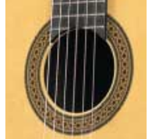
GC21/21C Hole Design