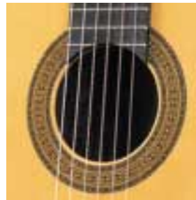
GC41/41C Hole Design

Solid spruce/American cedar with rosewood offers excellent cost performance in this Music Craft series model.