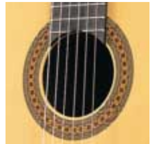
GC31/31C Hole Design