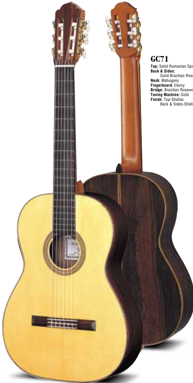
Top: Solid Rumanian Spruce

Top: Solid Rumanian Spruce Back & Sides: Solid Brazilian Rosewood Neck: Mahogany Fingerboard: Ebony Bridge: Brazilian Rosewood Tuning Machine: Gold Finish: Top-Shellac Back & Sides-Shellac