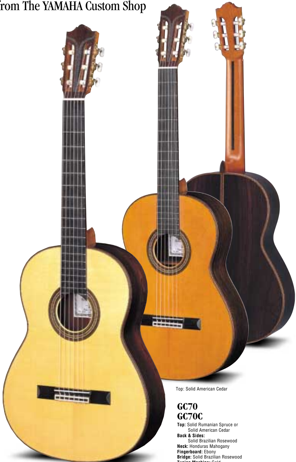
Top: Solid American Cedar