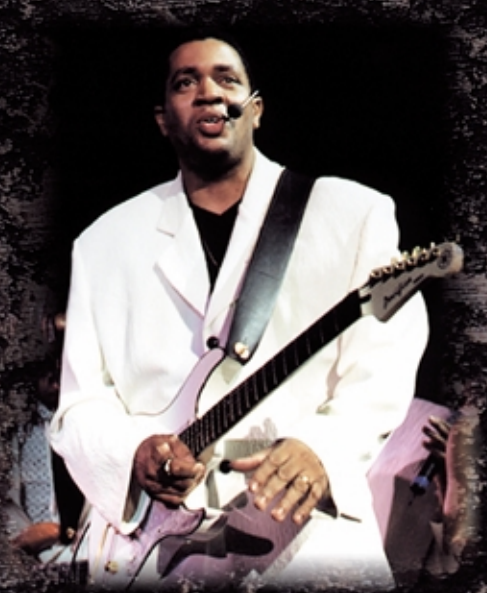
Sheldon Reynolds (Earth, Wind and Fire) http://www.rothmedia.com/sheldonsworld/index.html