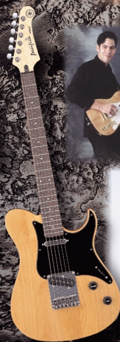
102SX Natural Satin