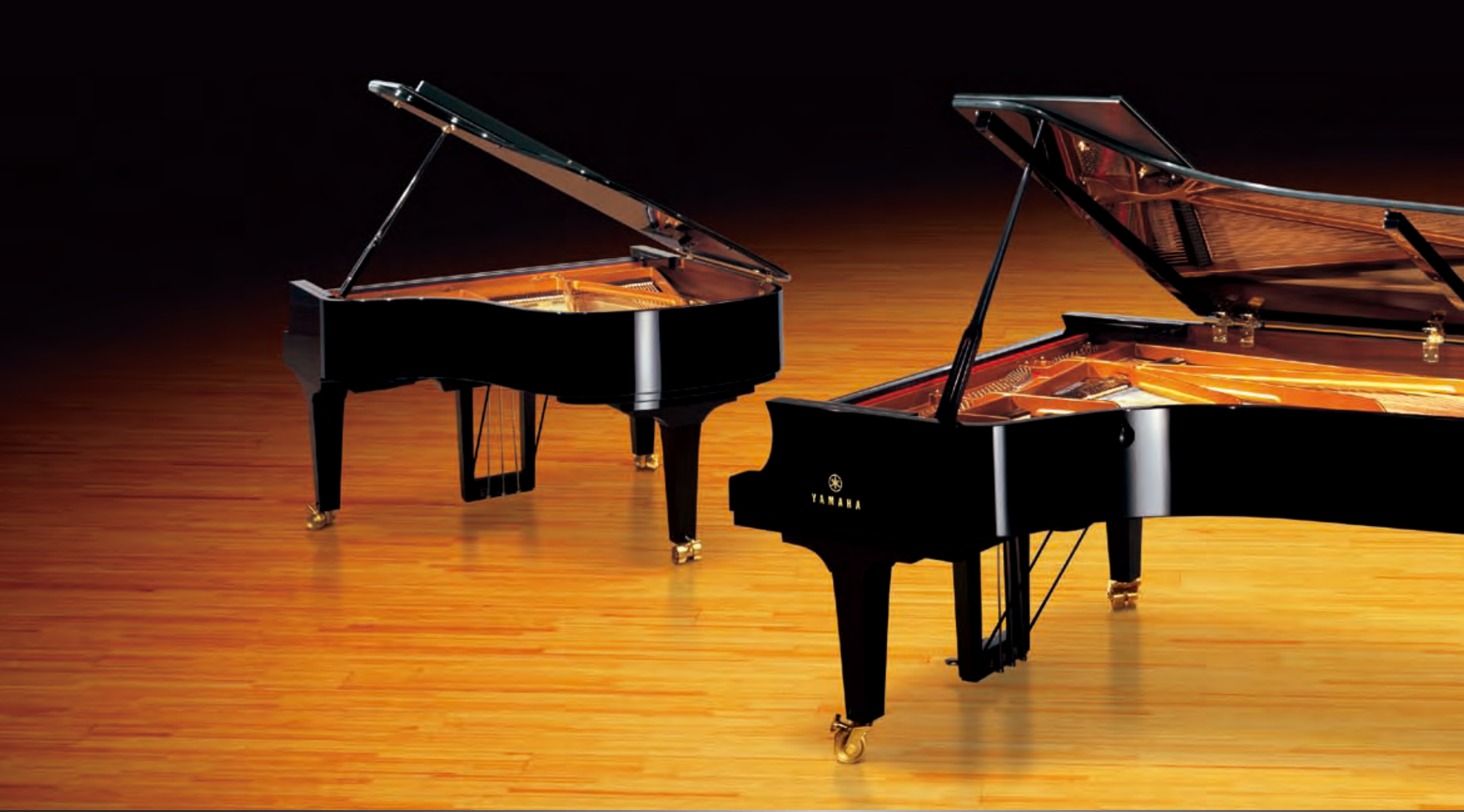
The CF Series Family