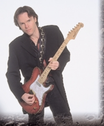
Mikael "Nord" Andersson (Roxette)