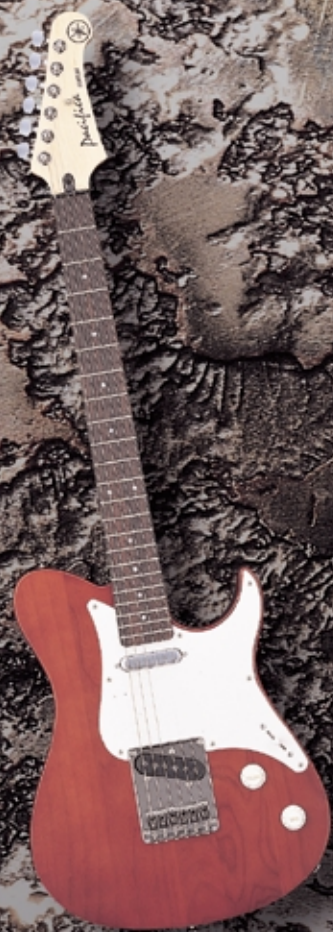
102S Light Brown Satin