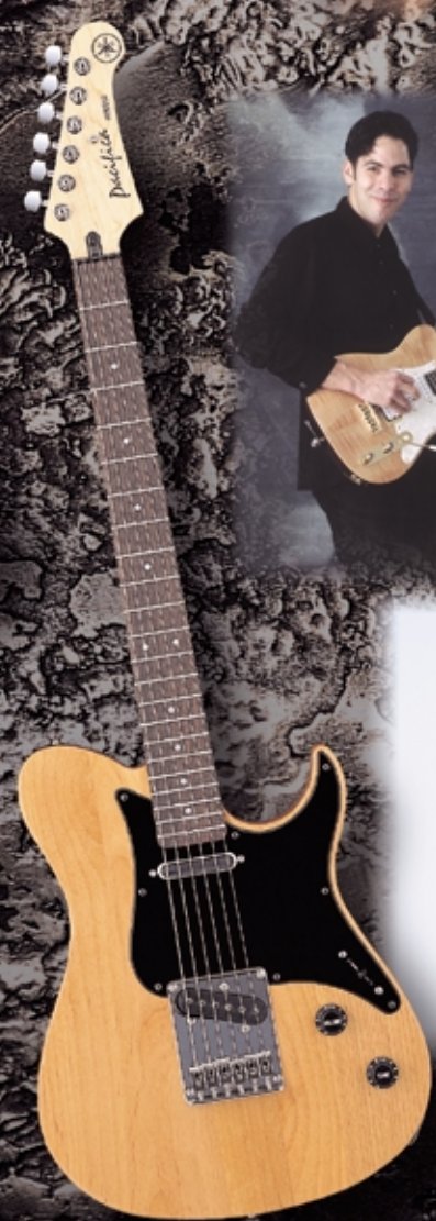
102SX Natural Satin