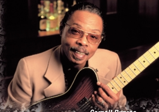
Cornell Dupree (Soul Survivors, Stuff)