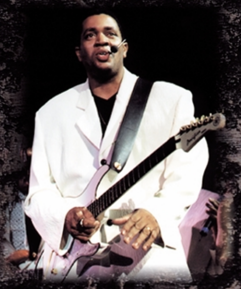
Sheldon Reynolds (Earth, Wind and Fire) http://www.rothmedia.com/sheldonsworld/index.html