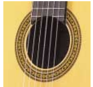
CG131S Hole Design