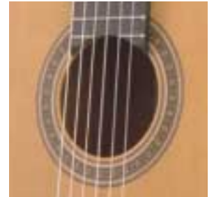
CG101MS/101M Hole Design

Solid Sitka spruce top with multi binding