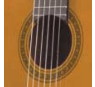
CG101/111S/111C Hole Design