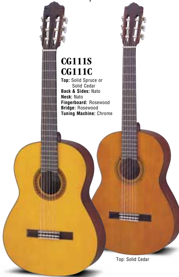
Top: Solid Cedar

Top: Solid Spruce or Solid Cedar Back & Sides: Nato Neck: Nato Fingerboard: Rosewood Bridge: Rosewood Tuning Machine: Chrome