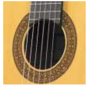
CG201S Hole Design