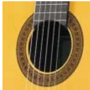
CG171S/171C Hole Design

Traditional style classic guitars with back and sides of rosewood, ebony fingerboard and premium American cedar or premium Solid Sitka spruce.