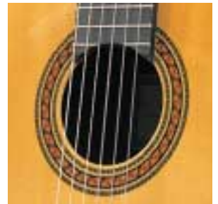
CG151S/151C Hole Design