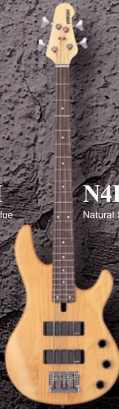
N4III Natural Satin