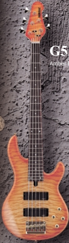
G5A Amber Burst