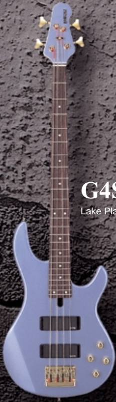
G4SII Lake Placid Blue