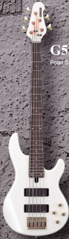
G5S Pearl Snow White