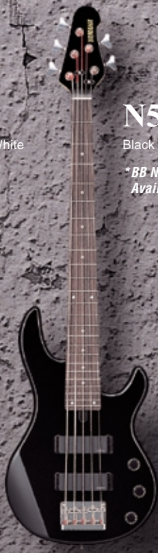
N5II Black *BB N5LII: Left Handed Model Available