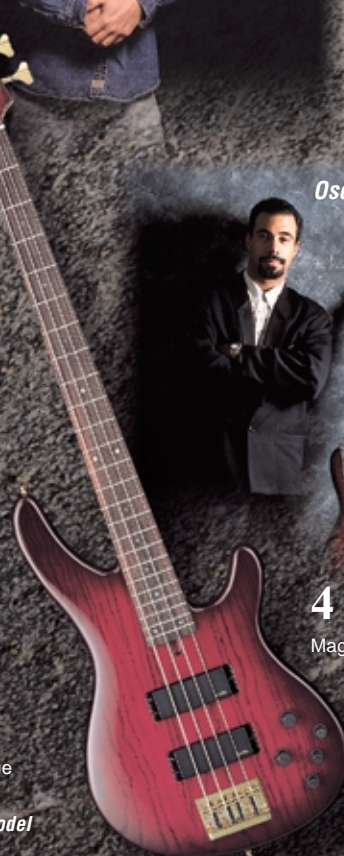
4 II Magenta Burst