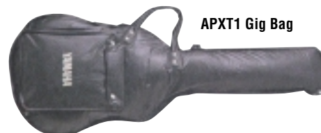
APXT1 Gig Bag