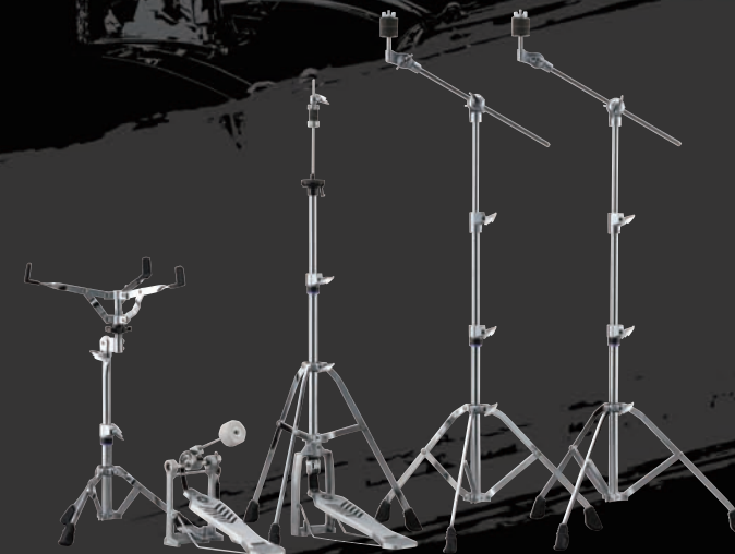
HW680 : CS655A×2 HS650A SS650A FP6110A