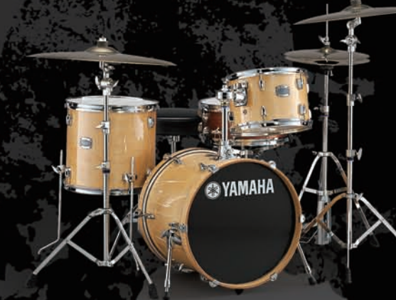
NATURAL WOOD (NW)