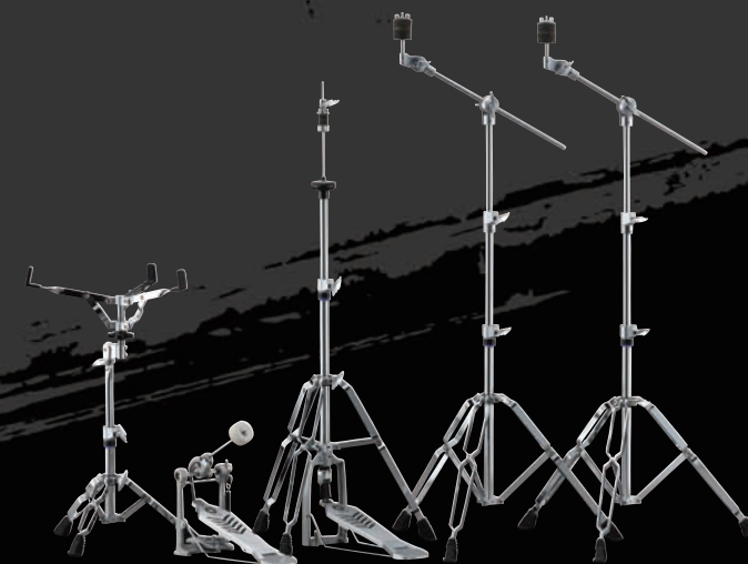
HW680W : CS665A×2 HS650WA SS650WA FP7210A