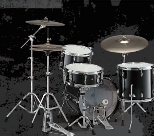
RAVEN BLACK (RB)

SCB8F3 : BBD618U BFT614U BTT610J BSD0655 CL945LB HW680 : CS655A x 2 HS650A SS650A FP6110A