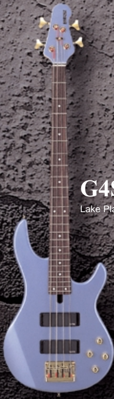
G4SII Lake Placid Blue