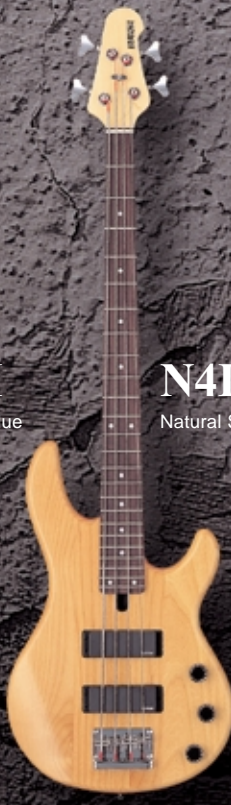
N4III Natural Satin