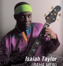
Isaiah Taylor (BAHA MEN)

*BB N4LIII: Left Handed Model Available BB N4FIII: Fretless Model Available