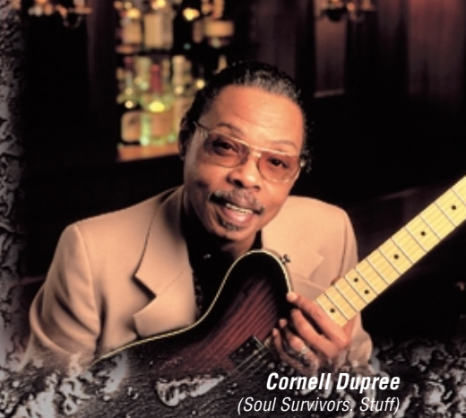
Cornell Dupree (Soul Survivors, Stuff)