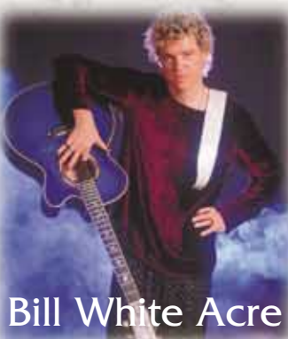
Bill White Acre

CPX15S Top: Solid Spruce Back & Sides: White Sycamore Neck: Mahogany Fingerboard: Ebony Bridge: Ebony Body Depth: 95-115mm (3-3/4"-4-1/2") String Scale: 650mm (25-9/16") Tuning Machines: Diecast Gold P.U. System: System 40 2 way Electronics: 4 Band EQ, AMF, Blend