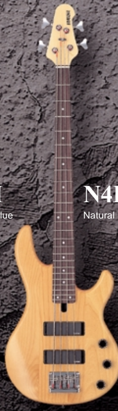
N4III Natural Satin