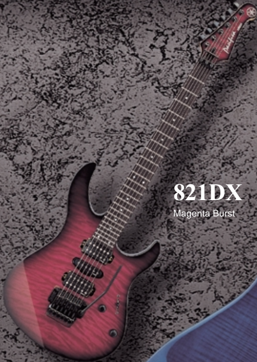
821DX Magenta Burst

Our craftsmen's flair for blending traditional styles with up to date technology and hardware is most evident in our Pacifica line. Although this series covers a wide range of instruments-from simple, straight forward models to deluxe models loaded with advanced features-each and every guitar is a quality instrument created with a quality solid-wood body, rugged hardware and a sleek, sturdy neck with impeccable fretwork. Double cutaway models include the 112 series with their excellent cost performance (the 112 is available in a left-hand model). The 312 models add an ash veneer with optional beautiful Translucent finishes and two Alnico single coil and an Alnico double coil pickups. Fitted with Wilkinson tremolo systems the 812s, unlike the 604W, are equipped with Seymour Duncan pickups. The 821 models and 904 feature Sperzel locking pegs with the 904 adding an American-made Warmouth neck. The 303-12II is a 12-string model with an ash veneer and three Alnico single coil pickups. Single cutaway models run from the simple but versatile 120 models with alder bodies a two single coil pickups, to the Mike Stern model with its ash body, and Seymour Duncan pickups.