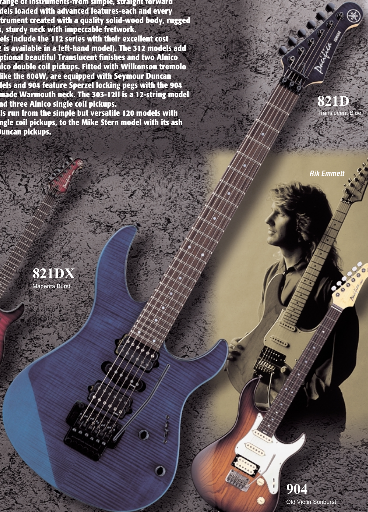
821D Translucent Blue