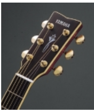
Headstock The DW/DWX series guitars feature beautiful mother of pearl inlays on their headstocks.