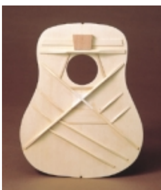
Bracing The bracing configuration found on the DW series is specially adapted for use on dreadnoughts from a design used on our LA series guitars. Along with excellent sound quality these instruments offer a powerful sound.