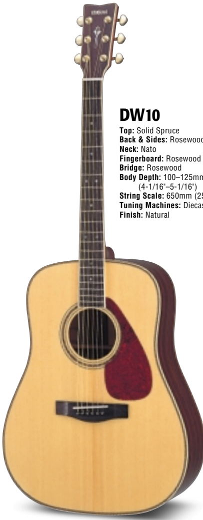
DW10 Top: Solid Spruce Back & Sides: Rosewood Neck: Nato Fingerboard: Rosewood Bridge: Rosewood Body Depth: 100–125mm (4-1/16"–5-1/16") String Scale: 650mm (25-9/16") Tuning Machines: Diecast Gold Finish: Natural