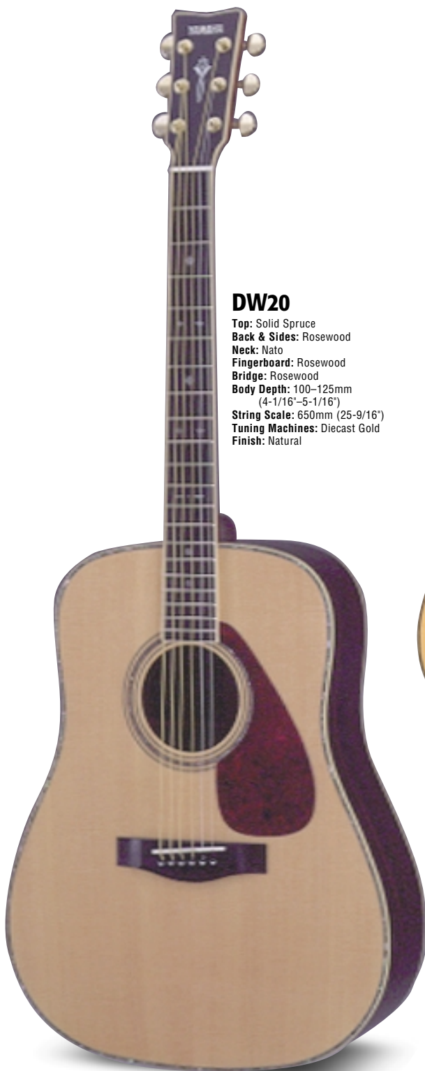
DW20 Top: Solid Spruce Back & Sides: Rosewood Neck: Nato Fingerboard: Rosewood Bridge: Rosewood Body Depth: 100–125mm (4-1/16"–5-1/16") String Scale: 650mm (25-9/16") Tuning Machines: Diecast Gold Finish: Natural

Nothing can compare to that big robust sound that a dreadnought produces. The DW/DWX series acoustic and acoustic/electric models produce a well-balanced tone, from solid lows to crystal clear highs, over the instrument's entire range. Select woods are finely crafted, with our craftsmen's expertise, into beautiful bodies and full-scale necks. Advanced electronics and piezo pickups in the electric/acoustic models accurately reproduce the powerfully rich tone of these fine instruments.