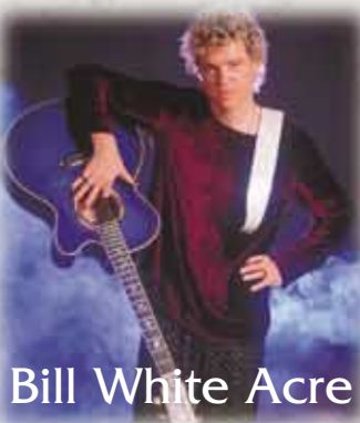
Bill White Acre

CPX15S Top: Solid Spruce Back & Sides: White Sycamore Neck: Mahogany Fingerboard: Ebony Bridge: Ebony Body Depth: 95–115mm (3-3/4"–4-1/2") String Scale: 650mm (25-9/16") Tuning Machines: Diecast Gold P.U. System: System 40 2 way Electronics: 4 Band EQ, AMF, Blend