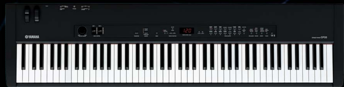
STAGE PIANO CP33