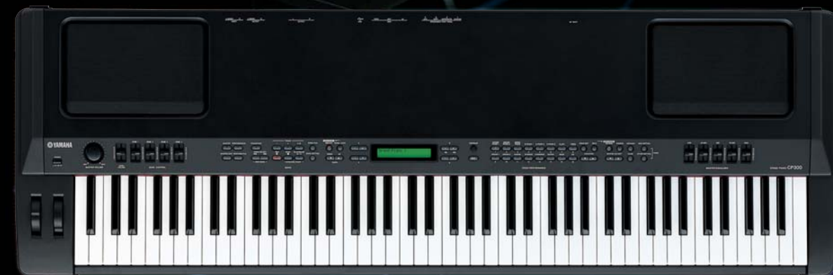
STAGE PIANO CP300

Drawing on our rich tradition and experience, these instruments give the live performer all the sound and expressiveness of a superbly mic'd grand piano with the portability and versatility of a modern digital instrument. Introducing the new standard in stage pianos—the CP series.