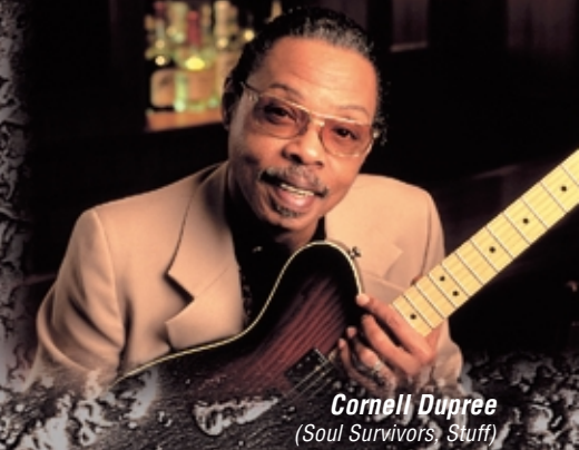
Cornell Dupree (Soul Survivors, Stuff)