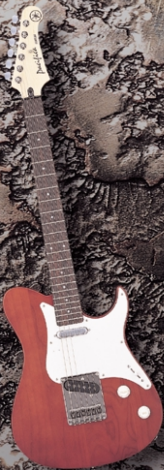
102S Light Brown Satin