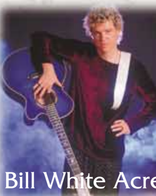
Bill White Acre

CPX15S Top: Solid Spruce Back & Sides: White Sycamore Neck: Mahogany Fingerboard: Ebony Bridge: Ebony Body Depth: 95-115mm (3-3/4"-4-1/2") String Scale: 650mm (25-9/16") Tuning Machines: Diecast Gold P.U. System: System 40 2 way Electronics: 4 Band EQ, AMF, Blend