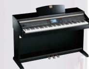
CVP-403PE Polished Ebony