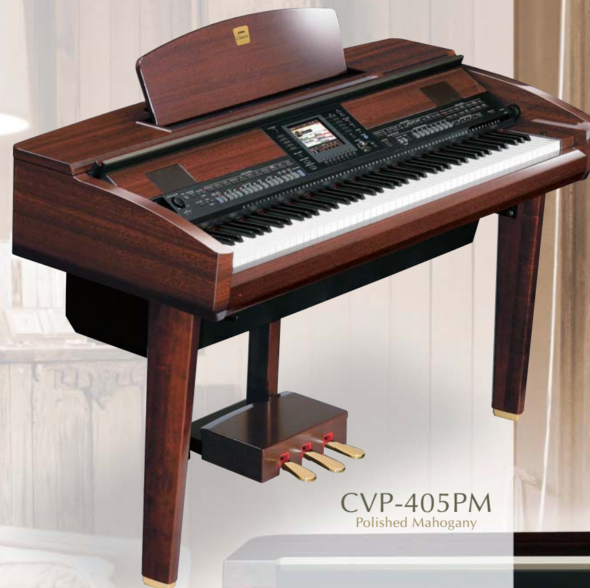
CVP-405PM Polished Mahogany