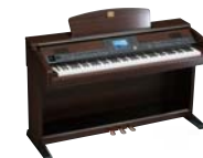
CVP-403PM Polished Mahogany