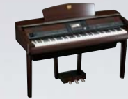
CVP-409PM Polished Mahogany