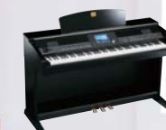
CVP-401PE Polished Ebony