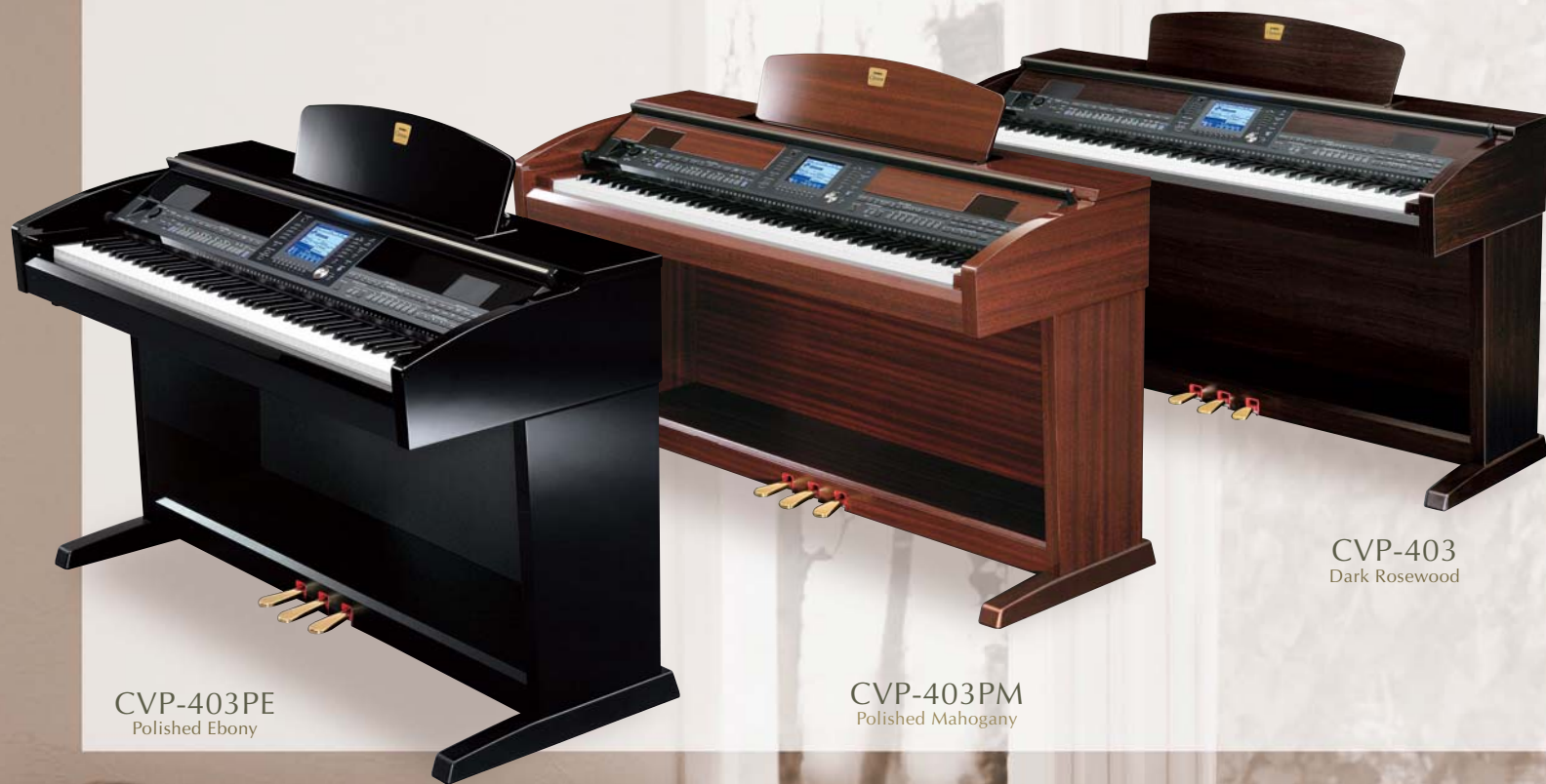
CVP-403PE Polished Ebony