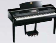
CVP-409PE Polished Ebony