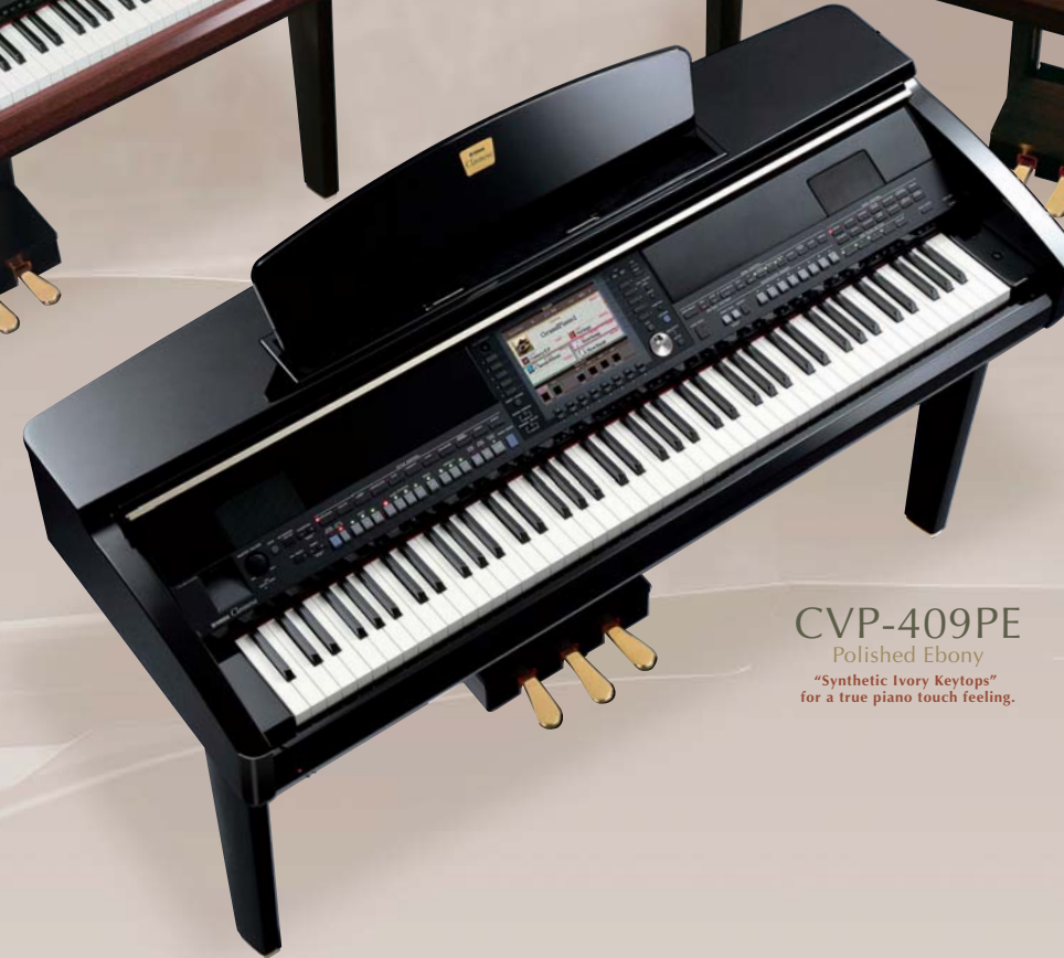
CVP-409PE Polished Ebony "Synthetic Ivory Keytops" for a true piano touch feeling.