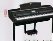
CVP-405 Dark Rosewood