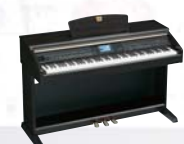
CVP-401 Dark Rosewood