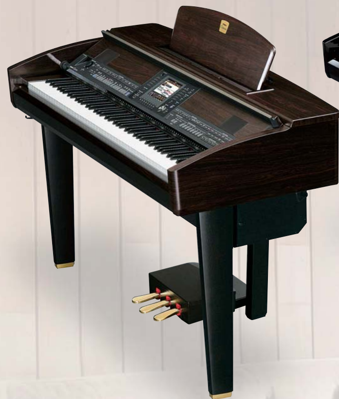
CVP-405 Dark Rosewood