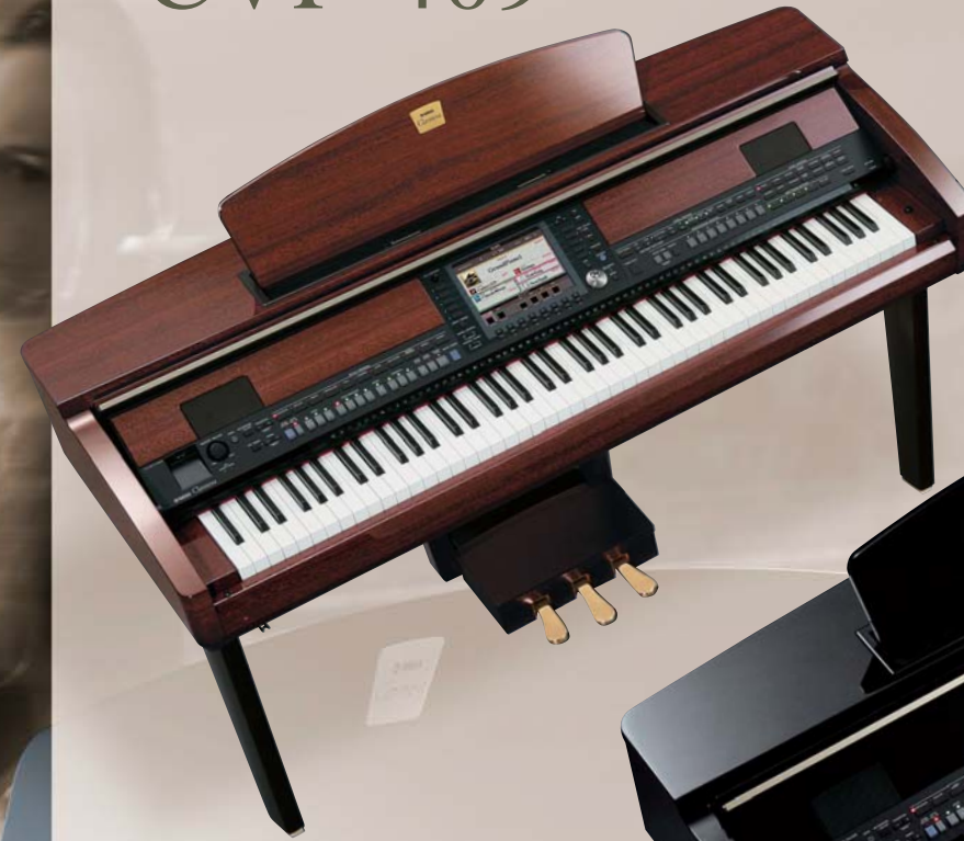
CVP-409PM Polished Mahogany "Synthetic Ivory Keytops" for a true piano touch feeling.