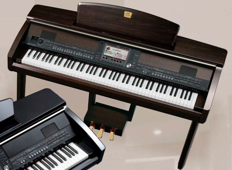
CVP-407 Dark Rosewood