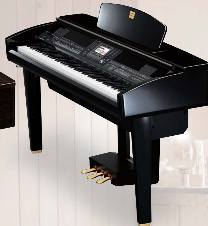
CVP-405PE Polished Ebony