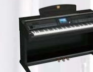
CVP-403 Dark Rosewood