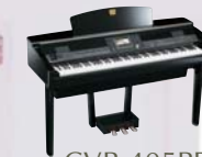
CVP-405PE Polished Ebony