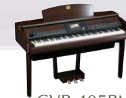
CVP-405PM Polished Mahogany