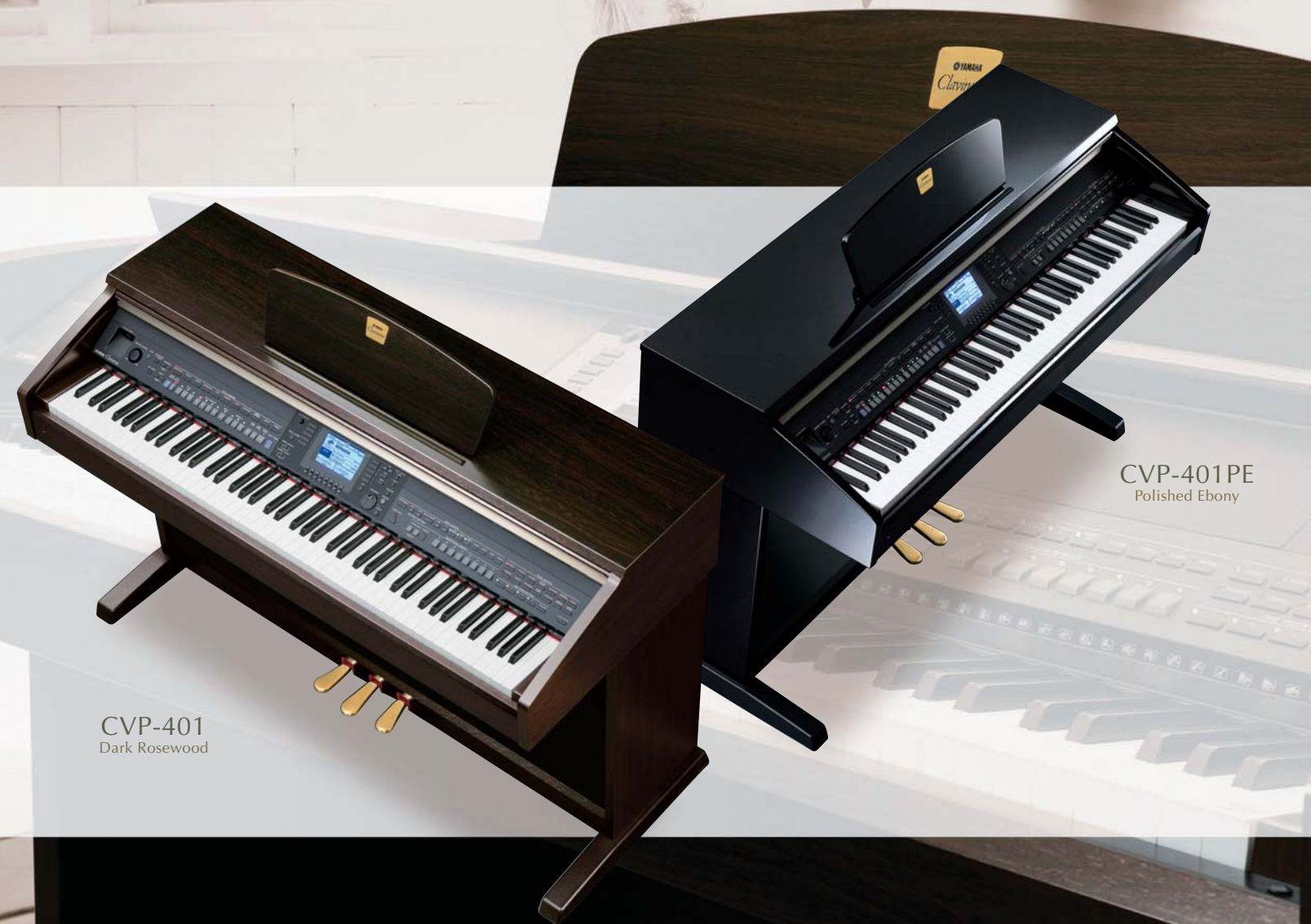
CVP-401 Dark Rosewood