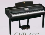
CVP-407 Dark Rosewood