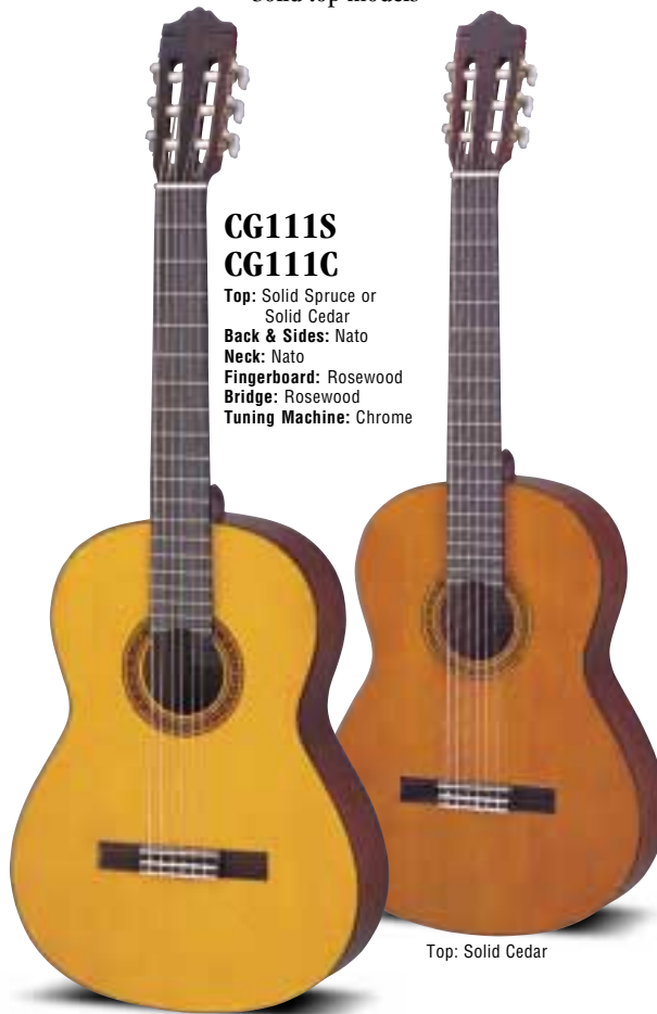
Top: Solid Cedar

Top: Solid Spruce Back & Sides: Nato Neck: Nato Fingerboard: Rosewood Bridge: Rosewood Tuning Machine: Chrome