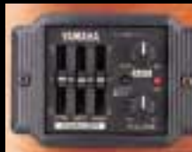
System 33 (CGX101)

The CGX111's electronics use EMF's highly responsive and ultra thin B-Band™ Pickup mounted under the saddle. This system's no frills approach supplies everything essential to tailor your sound with high and low tone controls and volume.