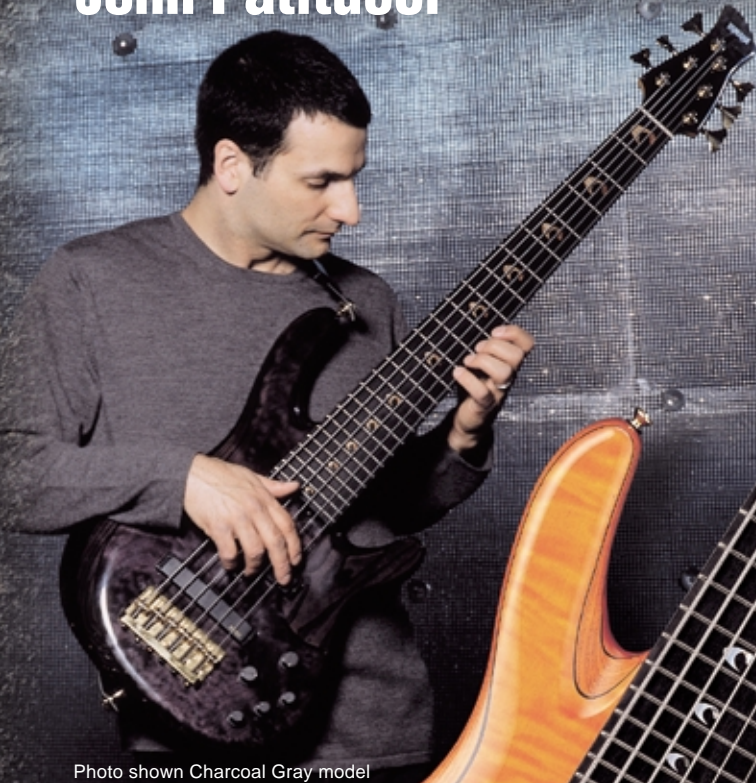
Photo shown Charcoal Gray model