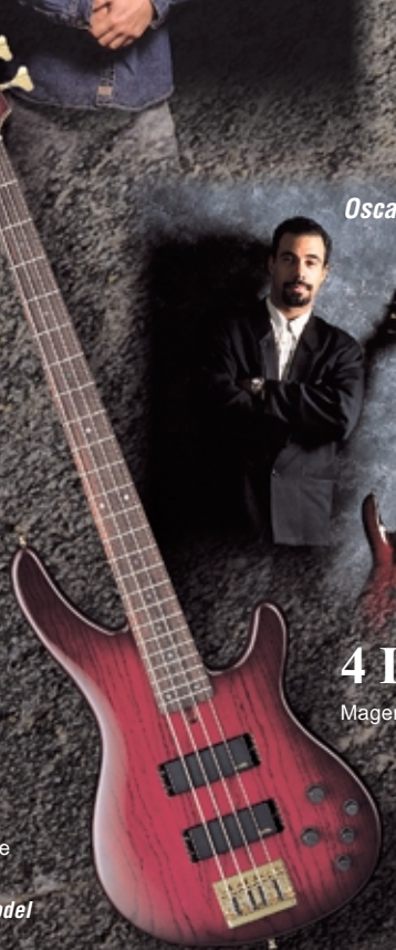
4 II Magenta Burst