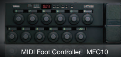
MIDI Foot Controller MFC10