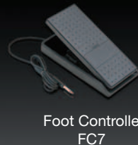
Foot Controller FC7