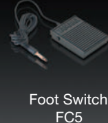
Foot Switch FC5