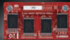
Flash Memory Expansion Module FL512M / FL1024M