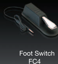
Foot Switch FC4