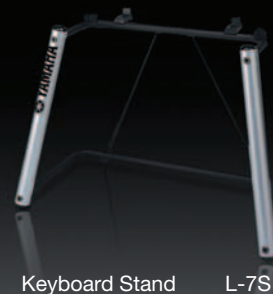
Keyboard Stand L-7S