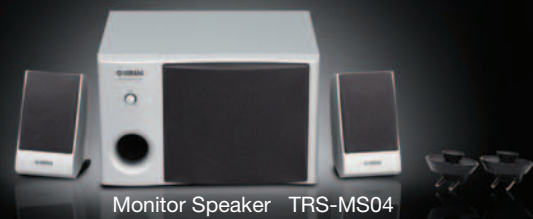
Monitor Speaker TRS-MS04