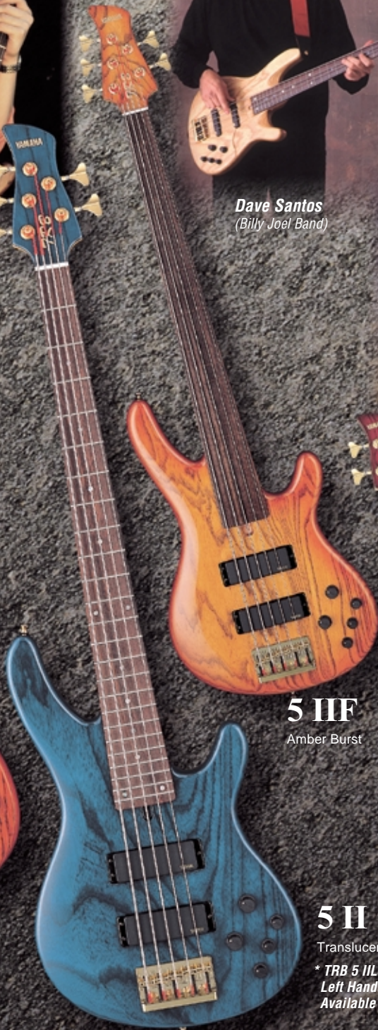
5 IIF Amber Burst