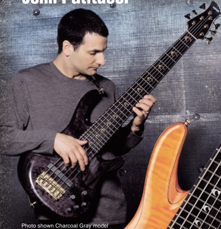
Photo shown Charcoal Gray model