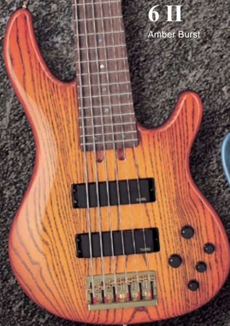
6 II Amber Burst